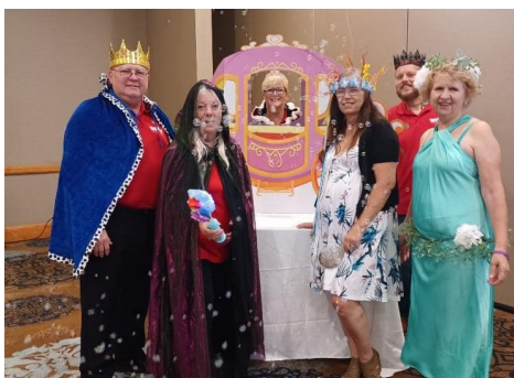
Officers as Disney Prince and Princesses