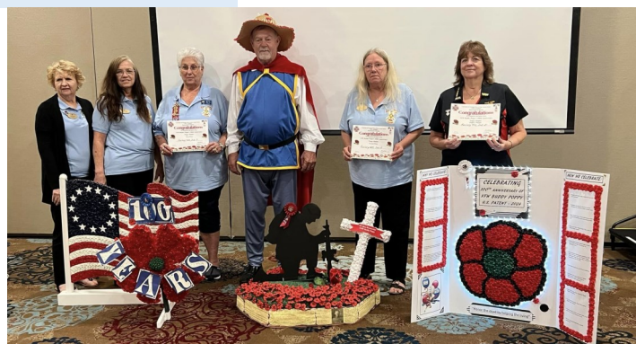
Buddy Poppy Winners—100th Anniversary Contest (left) 1st Place—Auxiliary 7122, (center) 2nd Place—Auxiliary 8205, (right) 3rd Place—Auxiliary 4412